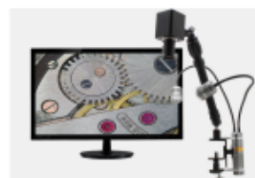
Mighty Cam - Microscopy