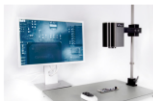
Visus ICON - High Definition Digital Microscope With telescopic movement of the camera