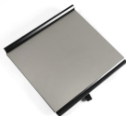
XY table part no: 9550001

You can also combine the system with our excellent XY table which allows you to precision control of the object you are working with. You can also use it with our Cmore tilt table which allows you to see the object in different angels.