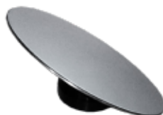
Tilt table part no: 9550008