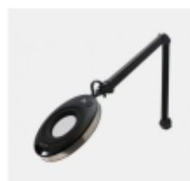
Magnifying Lamps & Accessories