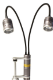
Lightning 1 part no 26800B-519