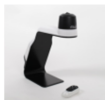
Emore Plus camera microscope