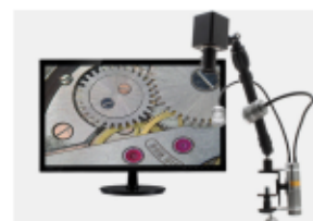
Mighty Cam - Microscopy