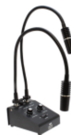
Lightning 4 part no 26800B-221