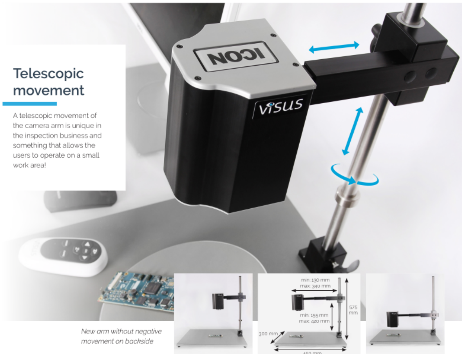
New arm without negative movement on backside

A telescopic movement of the camera arm is unique in the inspection business and something that allows the users to operate on a small work area!