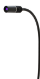
Lightning 3 part no 26800B-GNUV