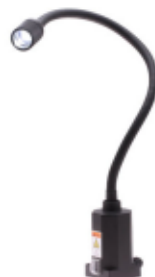
Lightning 2 part no 26527